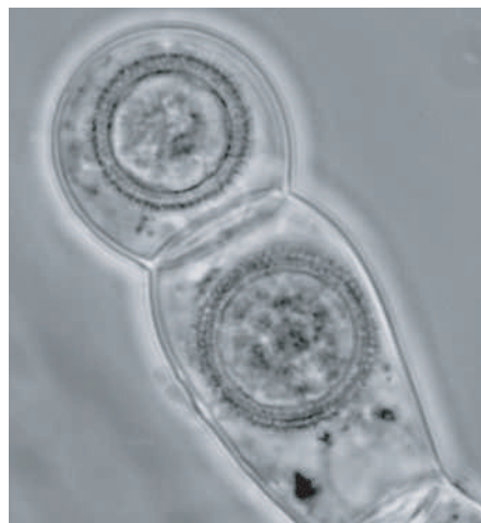
Figure 2 | Rozella allomycis . This parasite of other members of the same phylum, the Chytridiomycota, seems to be one of the most primitive fungi. Its resting sporangia (spore-producing bodies) are approximately 18 \mu\text{m} across and are shown within a hypha of its host chytrid, Allomyces .

The placement of the microsporidia themselves is another notable result. On the one hand, the analyses with 18S sequences originally put them at the base of the eukaryotic tree, distant from fungi, animals and plants. But this conclusion turned out to be erroneous owing to a confounding factor known as long-branch attraction. Other studies using protein-coding genes had previously placed them in the fungi, but the exact relationship was unclear because of limited sampling within the kingdom 3,4 . James and colleagues 1 have now improved the sampling dramatically, and show that the microsporidia must be either at the base of the fungal tree, within